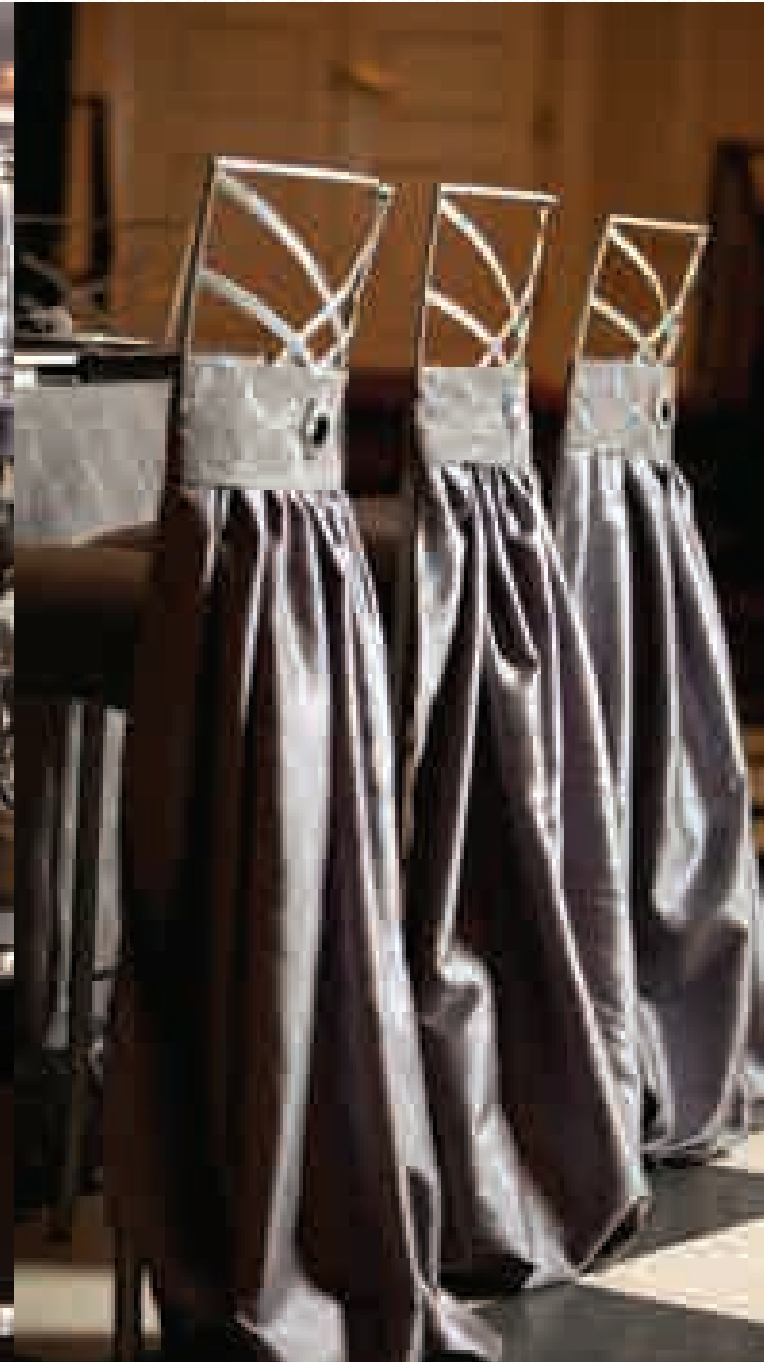
Photography by Walters & Walters at The Carolina Inn