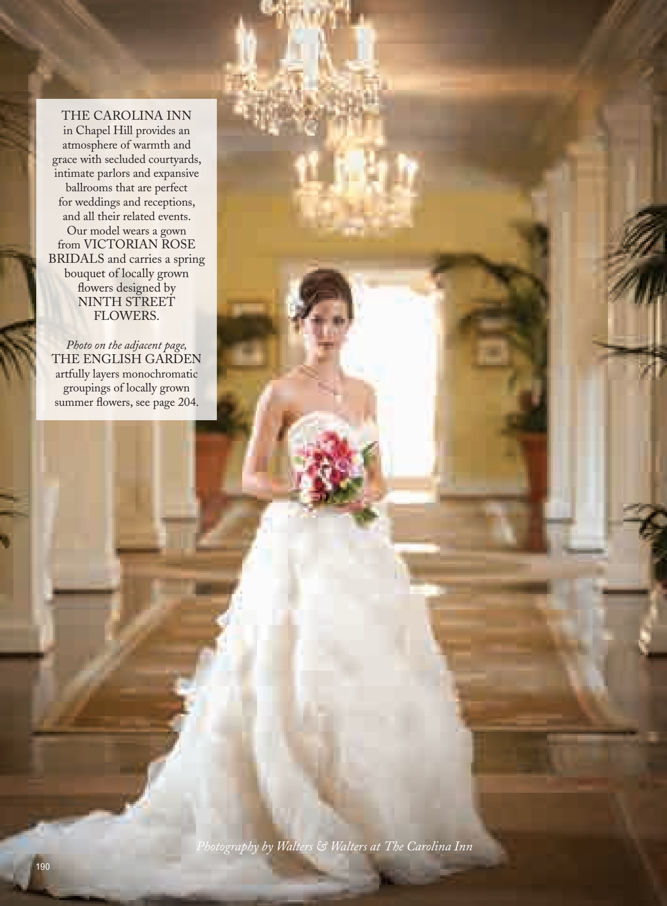
at The Carolina Inn

Photo on the adjacent page, THE ENGLISH GARDEN artfully layers monochromatic groupings of locally grown summer flowers, see page 204.