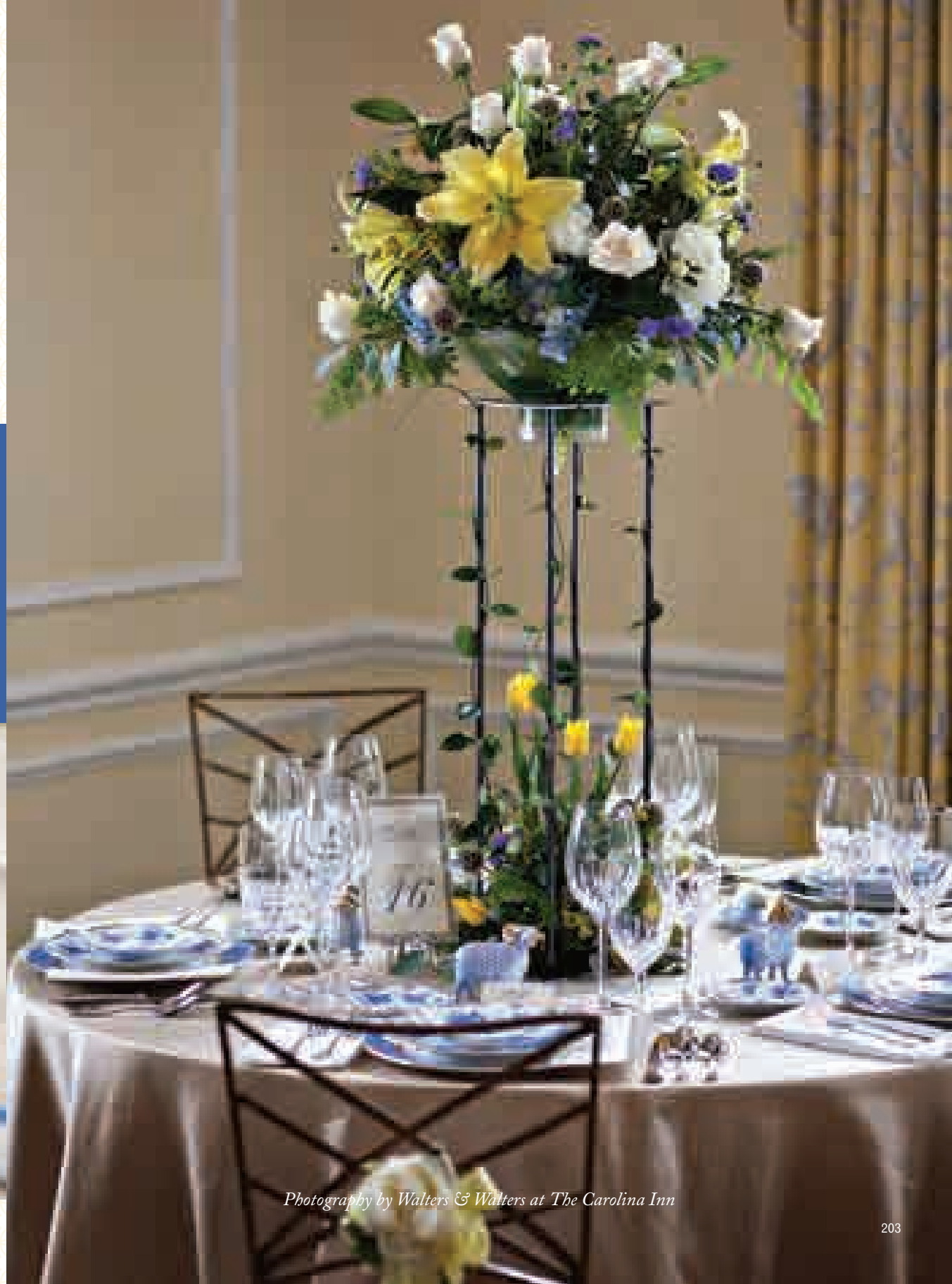
Photography by Walters & Walters at The Carolina Inn