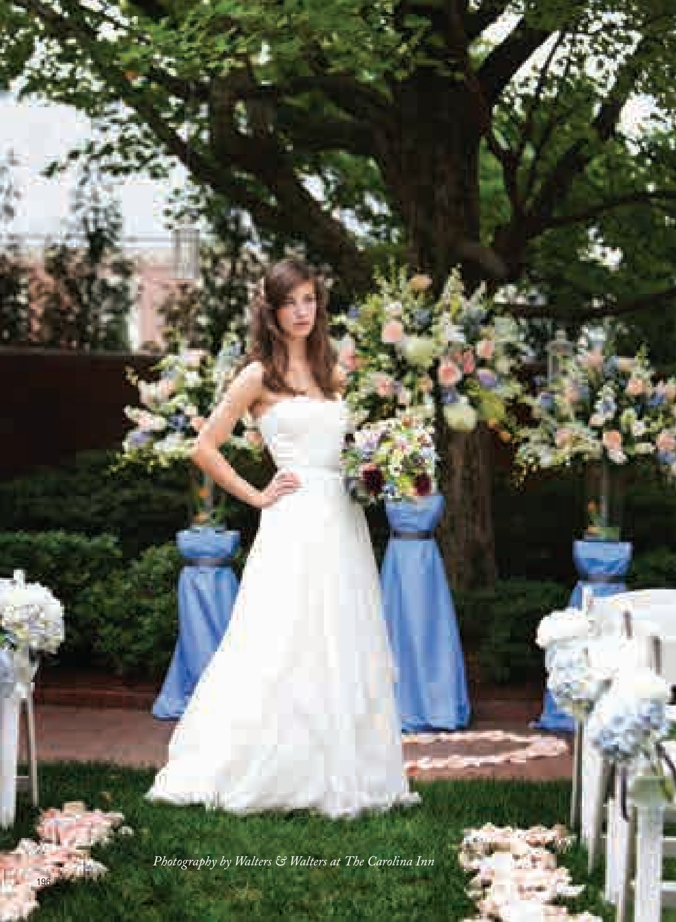
at The Carolina Inn