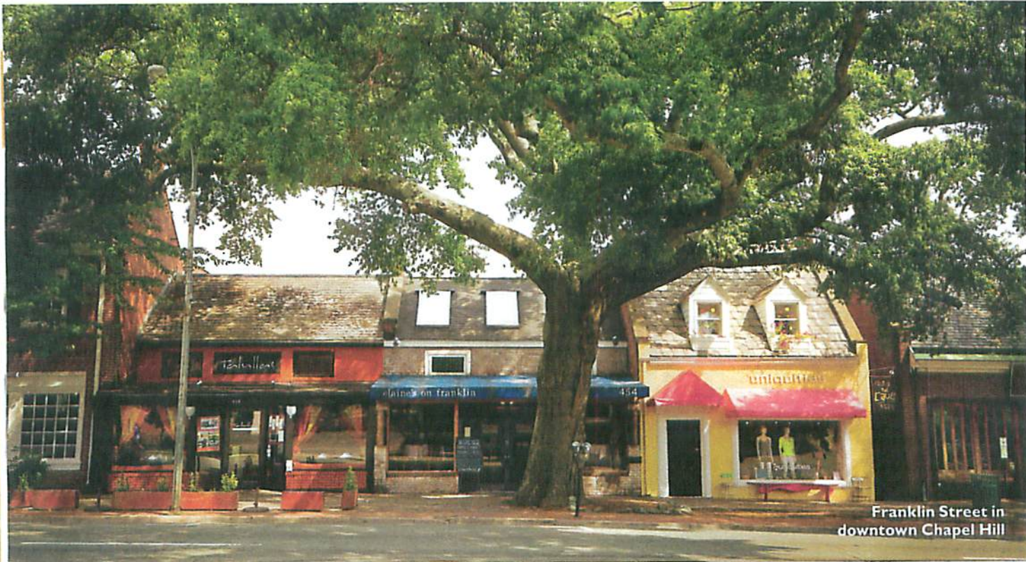
Franklin Street in downtown Chapel Hill