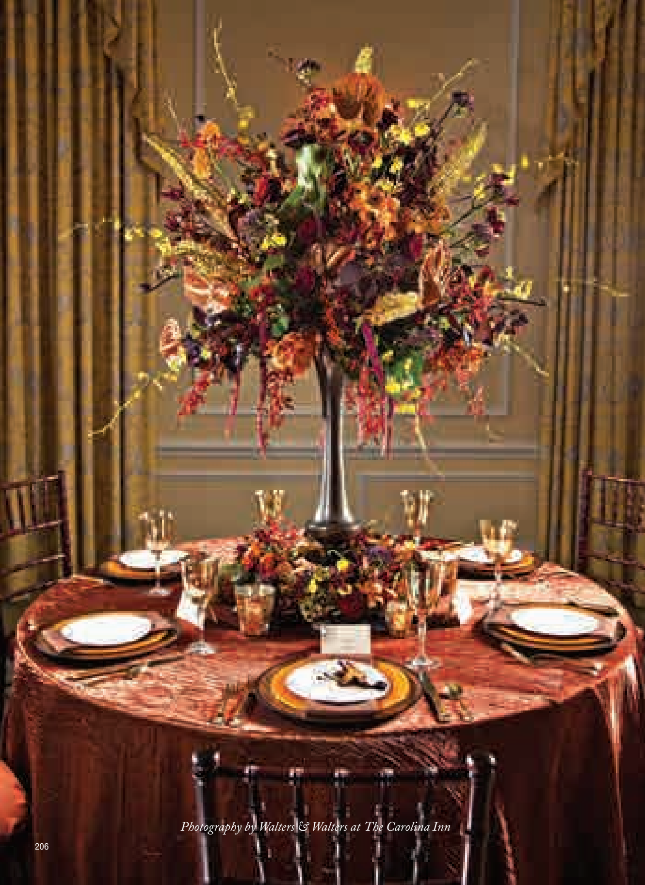
Photography by Walters & Walters at The Carolina Inn